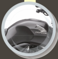
Mat Axis Gray Metallic