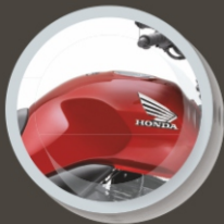
Imperial Red Metallic