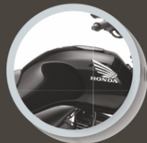
Pearl Igneous Black

*The technical specifications and design of the vehicles may vary according to the requirements and conditions without any notice Unicorn meets Bharat Stage VI norms. Product shown in the picture may vary from actual product available in the market. Accessories shown in the picture are not part of standard equipment. **Only rear tyre is HET. **Conditions apply.