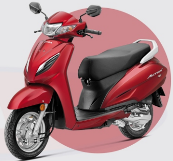
Pearl Spartan Red