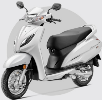
Pearl Precious White