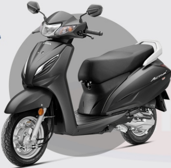
Matte Axis Grey Metallic