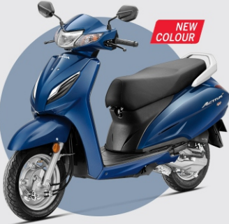
Glitter Blue Metallic