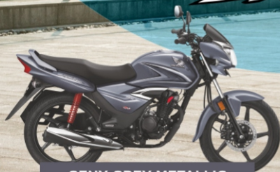
GENY GREY METALLIC